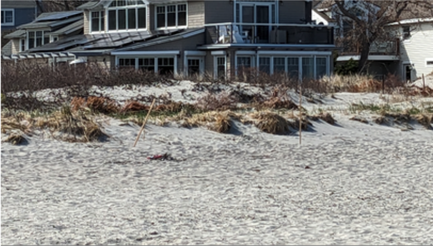
Photo (original, not from the Internet) of a place that feels like home *