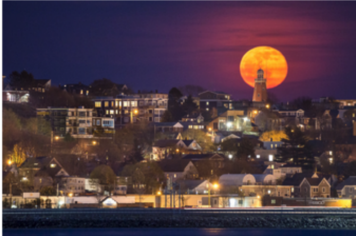
Photo (original, not from the Internet) of a place that feels like home *